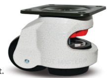
Cushion Support. Leveling Caster Wheel