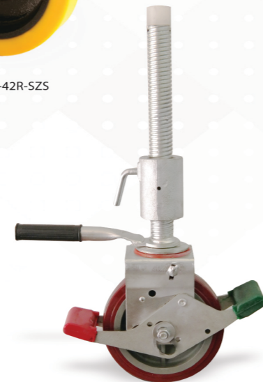
Scaffolding Castor Wheels