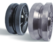
Gate and Track Roller. Designed for Inverted Track